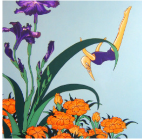
Jane Fairhurst Freefall 2

'raven plateau' is a solo exhibition comprising of new sculpture, photographic prints and large-scale drawings by Samantha Donnelly . These elements are brought together to create a series of vignettes that depict landscapes. The double-height, sparse interior space at Persistence Works will act as a temporary horizon for the assemblages offering a notional picture plane. Yorkshire Artspace Society from 4th – 22nd February 2008.