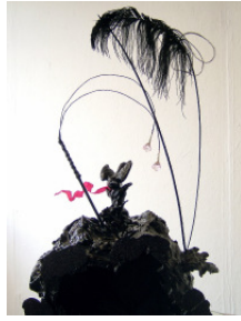
Samantha Donnelly raven plateau (detail)